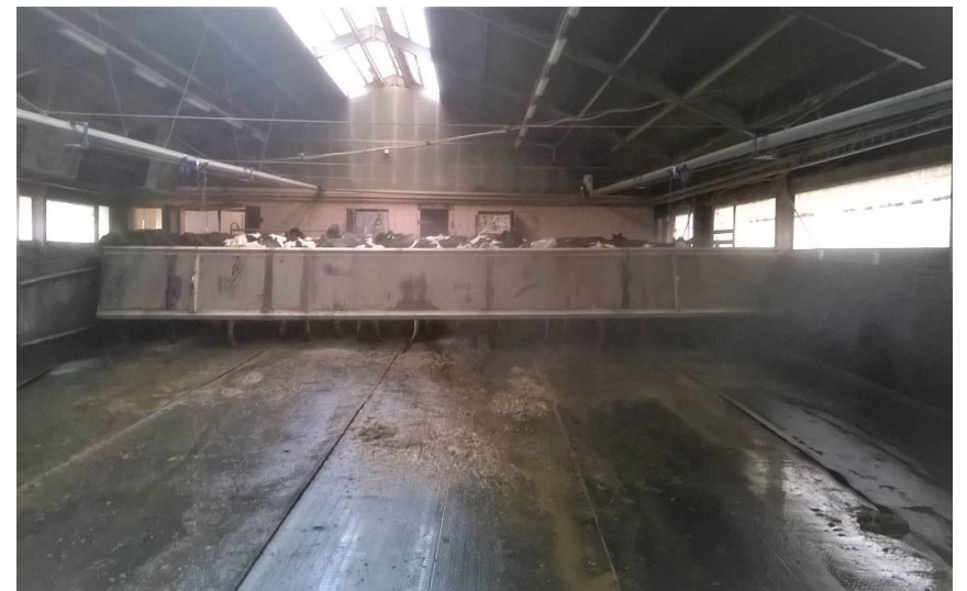
Fig. 1. Cow mechanical driver Cow Mover M of the company DeLaval introduced on the training and research farm of the Latvia University of Agriculture "Vecauce"

In 2007 on the training and research farm of the Latvia University of Agriculture "Vecauce" a new milk cow barn was built where side-by-side parlour type milking equipment with 2 x10 milking places was installed. At the beginning this equipment was used without the mechanical cow driver. Therefore, the cow tenders – cow drivers had to drive the cows to the waiting yard and then further to the milking parlour often engaging in this work also the milkers. But in 2016 the mechanical cow driver offered by the company DeLaval Cow Mover M was installed in the barn (Fig. 1).